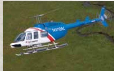
Oil & Gas